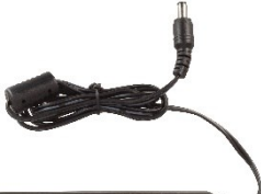
1 x Power Supply