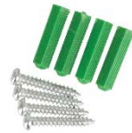
1 x Mounting Hardware