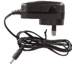
1 x Mains Power Adaptor