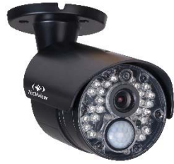
1 x Wireless Camera