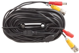
1 x 18m Video & Power Cable