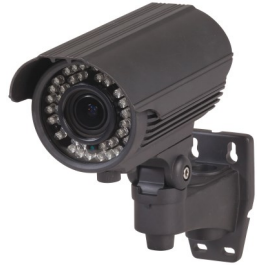
1 x 1080p 4-In-1 Vari-Focal Bullet Camera