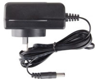
1 x Mains Power Adaptor